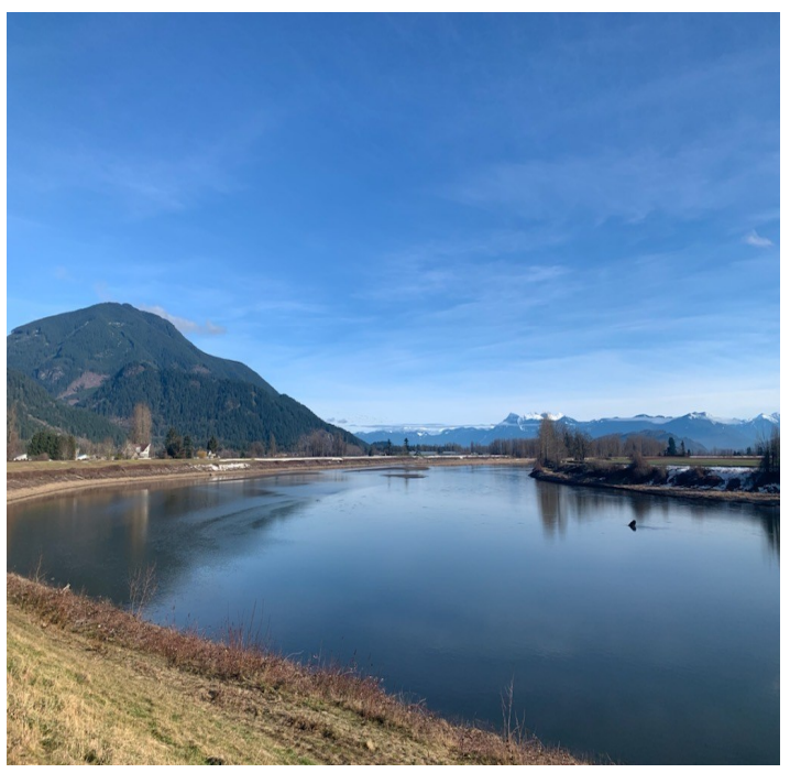
Above: Dewdney students and staff spend time at the Nicomen Slough located next to Dewdney Elementary. Below: Each class has access to their own garden. Students spend time throughout the year planting, growing and Maintaining spaces around the school.